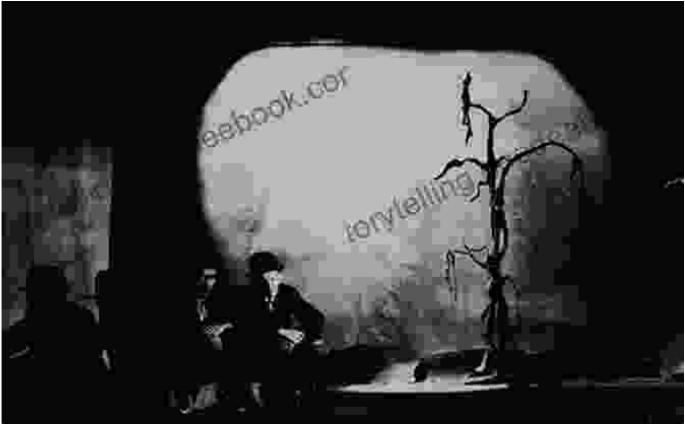
A vintage photograph of the Theater Company of the Golden Hind's production of 'Waiting for Godot.'