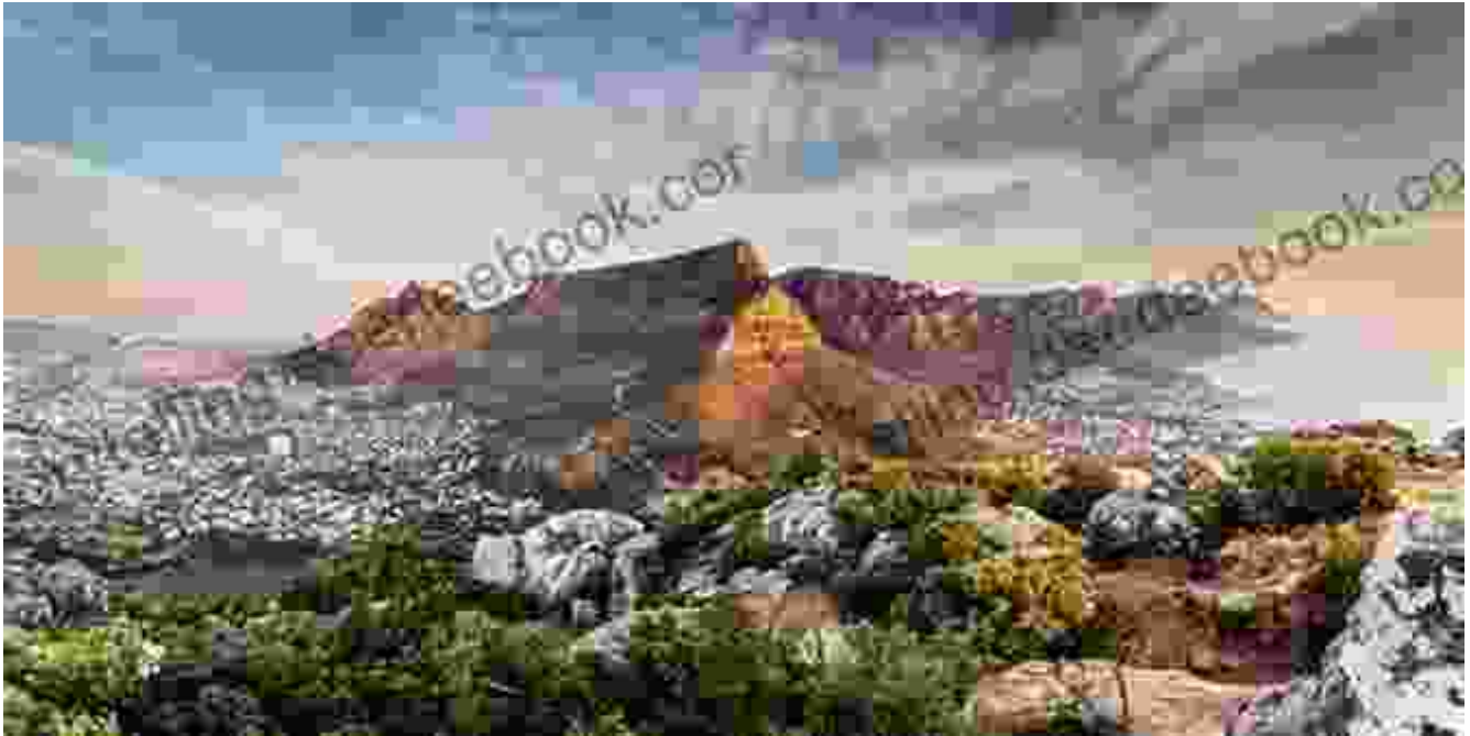
Table Mountain, towering over the city at an elevation of 1,086 meters (3,563 feet), is the most iconic and recognizable of the Rocks Mountains. Its distinctive flat top, which resembles a table, has earned it the affectionate nickname "Tablecloth Mountain." Table Mountain is a hiker's paradise, with numerous trails leading to its summit, offering breathtaking panoramic views of the city, surrounding mountains, and Atlantic Ocean.

The Table Mountain Cable Car, one of the most popular tourist attractions in Cape Town, provides a scenic and convenient way to ascend the mountain. The cable car ride offers stunning views of the city and its surroundings, and the summit station provides access to a network of hiking trails and viewpoints.