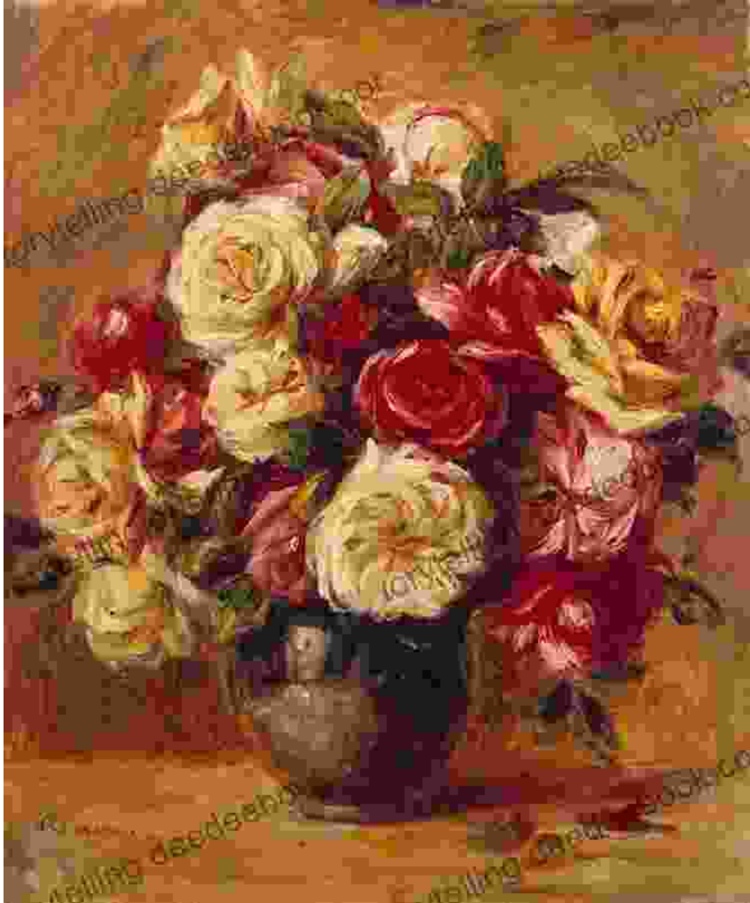
Pierre-Auguste Renoir, Public domain, via Wikimedia Commons

Pierre-Auguste Renoir's "Roses" is a vibrant and romantic painting that celebrates the beauty of flowers. The rich, deep colors and delicate petals convey the elegance and timeless beauty of roses, making this print a perfect choice for a sophisticated and romantic setting.