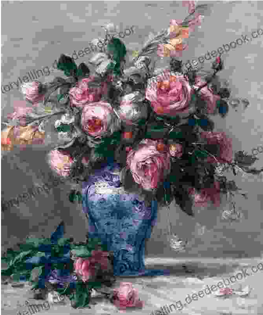
Pierre-Auguste Renoir, Public domain, via Wikimedia Commons

Pierre-Auguste Renoir's "Pink Roses" is a vibrant and romantic painting that celebrates the beauty of nature. The delicate pink petals and lush foliage convey a sense of joy and optimism, making this print a perfect choice for a bright and cheerful space.