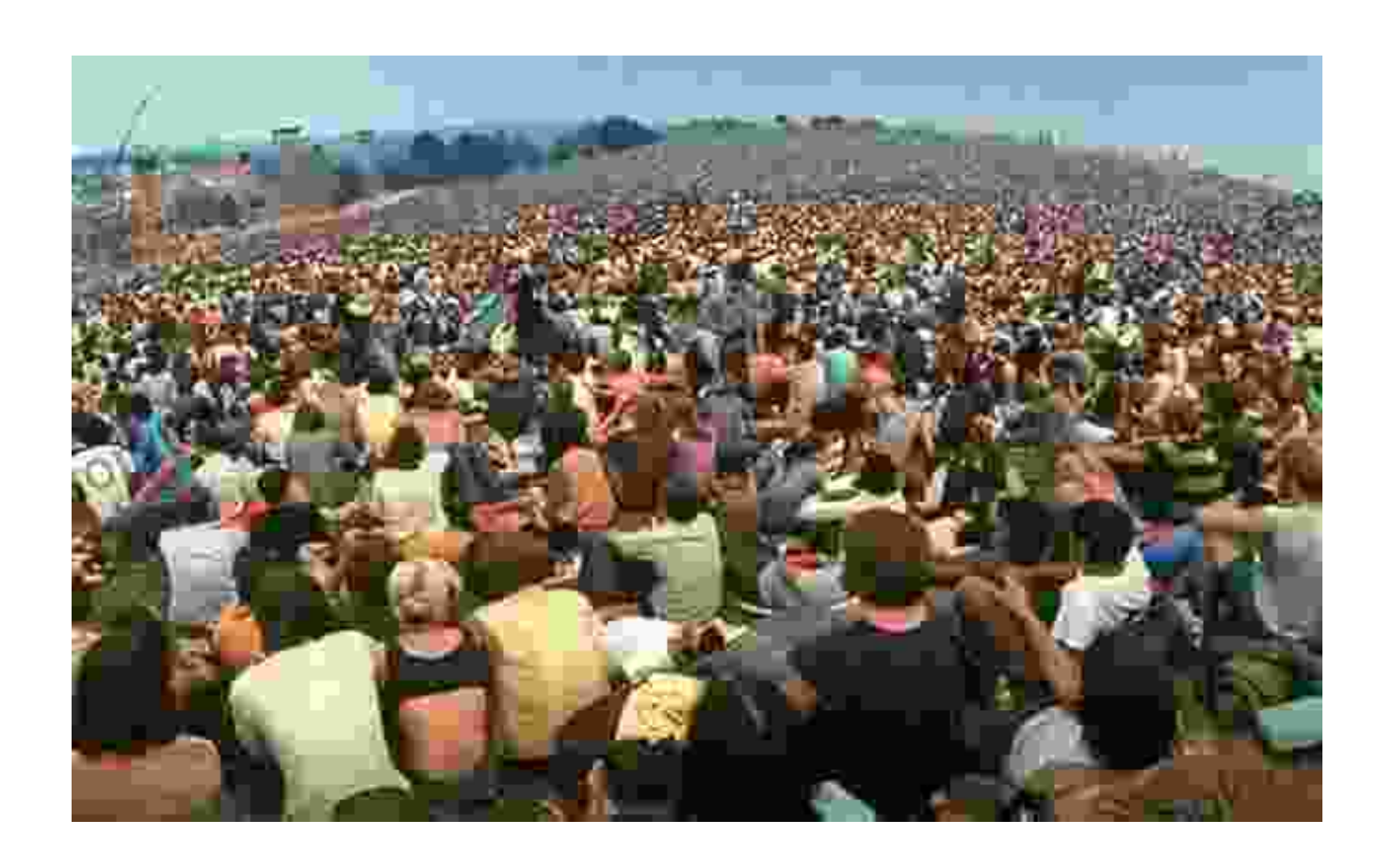
Chapter 3: The Rise of Modern Music Festivals

In the 1980s and 1990s, music festivals began to evolve into the modern events that we know today. These festivals were typically larger and more commercial than their predecessors, and they featured a wider range of musical genres. Coachella, Lollapalooza, and Bonnaroo are just a few examples of the many successful music festivals that emerged during this time.