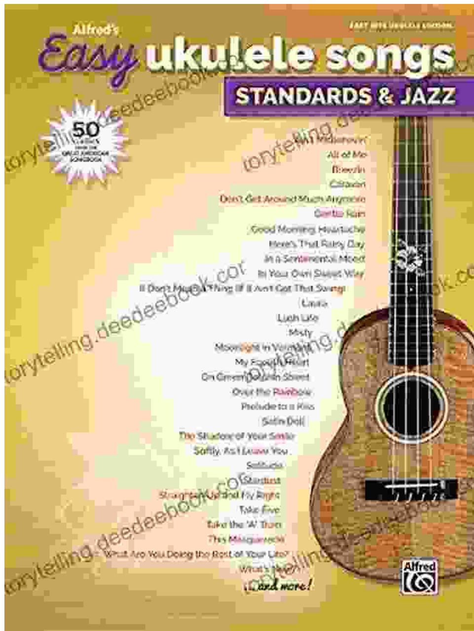
Alfred's Easy Ukulele Songs - Standards & Jazz: 50 Easy Classic Hits for Ukulele from the Great American

The ukulele is a great instrument for learning to play music. It's easy to learn, portable, and fun to play. With a little practice, you'll be able to play all of your favorite songs. So what are you waiting for? Pick up a ukulele and start playing today!